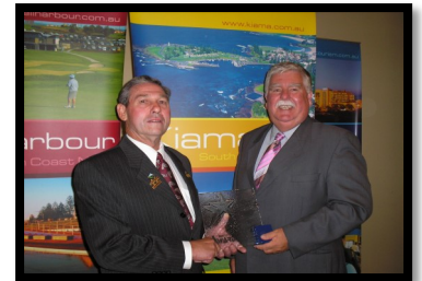
Tourism Industry Awards