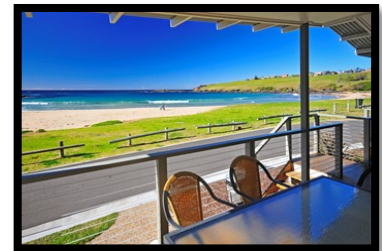
Overlooking the Beach