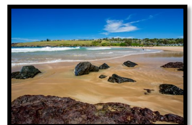
East's Beach Today

From a dairy farm back in the 19th century, East's Beach has grown into a glorious tourist destination that sees loyal guests coming back again and again. The holiday park was built on strong foundations of hard work, determination and a passion for the industry. Several lifetimes worth of work have gone into creating a reputable establishment that strives to give guests the best possible experience. No doubt the holiday park will continue to excel and remain a treasured part of Kiama for many more years to come.