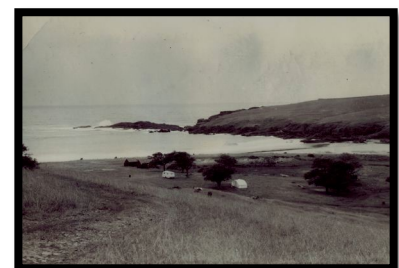
East's Beach in the 1930s

By the time Bruce took ownership of "Prospect" visitors began to come over the hill to gaze down at what is now known as Easts Beach. After a time, men carrying tents on their back were asking if they could set up camp and Bruce was happy to oblige. With Australian hospitality at its best, it wasn't long before others found their way to the secluded lagoon. The family dairy remained fully operational with campers and cows sharing the land in harmony.